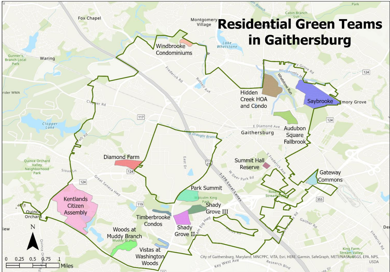
Figure 1. Residential Green Teams in Gaithersburg as of 2022