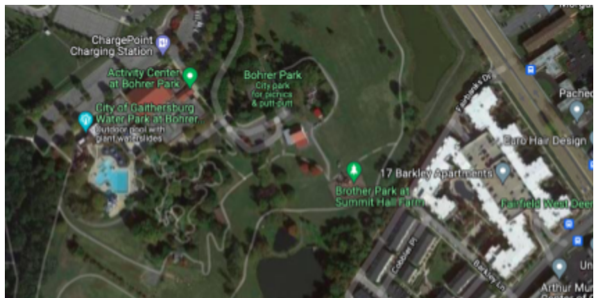
Figure . Bohrer Park, on the northwestern boundary of the community, offers an opportunity for a variety of volunteer stewardship projects.

This could include Bohrer Park, twice per year.