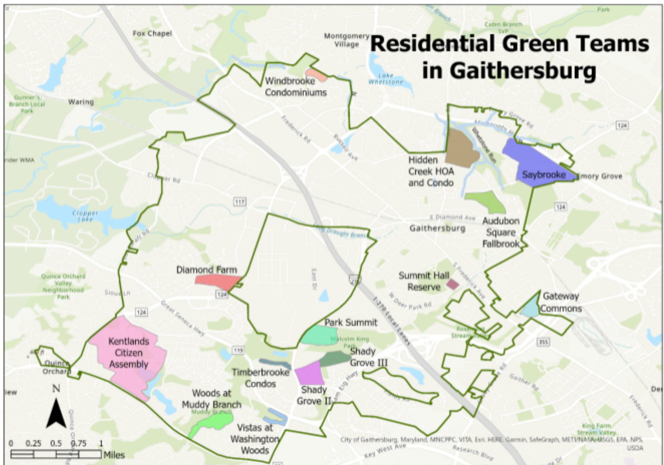
Figure SEQ Figure \* ARABIC 1. Residential Green Teams in Gaithersburg as of 2022

Opportunities with adjacent 17 Barkley Apartments, as well as other HOAs near the Muddy Branch/Whetstone sub-watershed (Audubon Square, Hidden Creek, etc.) City can provide coordination as well.