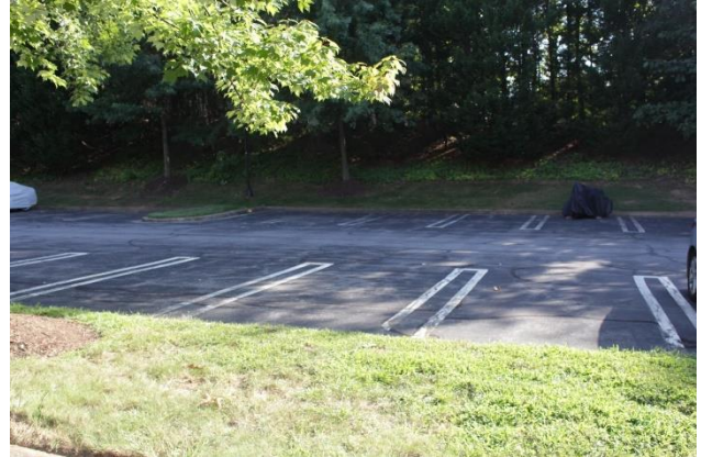
Figure 7. Underutilized parking area presents many opportunities

High Priority. All parking spaces are common, first come, first serve with no reserved spaces other than those reserved for disabled parking. Parking in the far lots are relatively unused and underutilized which presents various opportunities for infrastructure with co-benefits (e.g., bicycle parking racks/shed, electric vehicle charging stations, conversion to pervious asphalt, etc.).