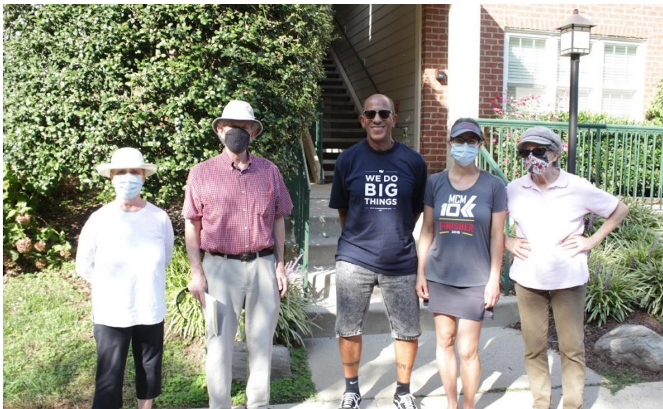
Figure 1. Timberbrook Green Team 2021

The Timberbrook Green Team Action plan is a living document that establishes priority actions for the next three years and serves as a tool for Green Team members to stay organized and track progress over time.