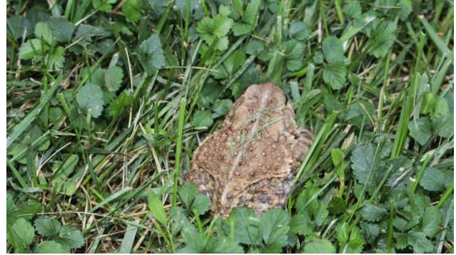
Figure 4. Frog from "Frog Pond" near Timberbrook Entrance

There is also an opportunity to coordinate with the City on a grant-funded restoration/enhancement project at the “Frog Pond.” This pond area, which is owned by the City, is immediately adjacent to Timberbrook’s front entrance, at the base of converging slopes that drain to Muddy Branch. The pond is an intermittent wetland with wildlife habitat area that supports a variety of species.