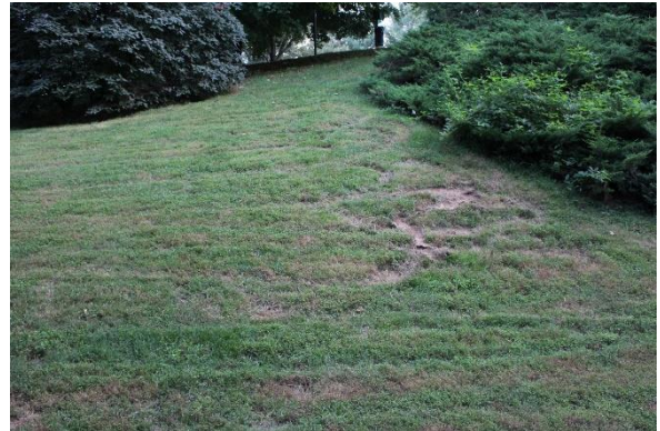
Figure 5. Areas with slope erosion can serve as potential restoration sites, conversion to wildflower meadow and no-mow zones