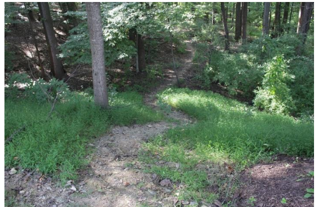
Figure 3. Trail Access to Muddy Branch Stream Corridor

Low Priority. Trail access to Muddy Branch stream corridor: property is immediately adjacent to the Izaak Walton League, which has trail network that is accessible to all residents (via Pepco entrance; via Kentlands; and across Muddy Branch). Opportunities for various partnerships with IWL could include: cleanups, invasive species removals, plantings, etc. Explore future opportunities to partner with UMD, Muddy Branch Alliance, CBT, etc. to help build capacity and provide technical assistance (e.g., grant writing, research, etc.).