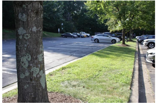
Figure 6. Parking median strips can serve as potential locations for native wildflowers/pollinator garden

High Priority. Locations on slopes, parking medians, and common areas offer opportunities for pollinator-friendly plantings.